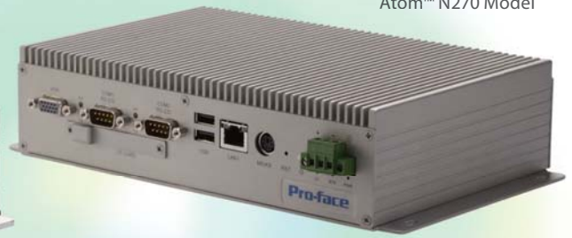
PE4000B Atom™ N270 Model