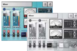
Support for Monochrome Display