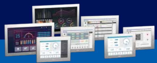
Industrial Flat Panel Monitors FP6000 Series

Industrial Flat Panel Monitors FP6000 Series adapt with various host devices that you need, with a high-quality and stylish design display and high robustness. FP6000 Series fits the most suitable place for machine operation by installing separately to improve your machine's operativity.