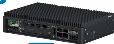
PS-6000B standard box