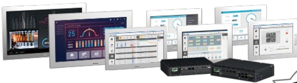
PS-6000B advanced box