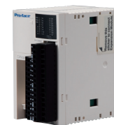
CANopen Slave Module

Cutout Compatible for: GP570, GP577R, GP2500, GP2600, GLC2500, GLC2600