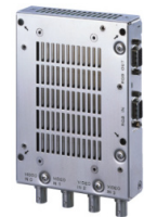
Video Input Module