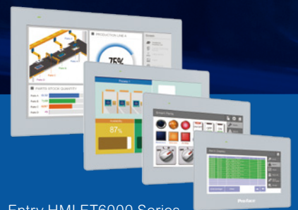
Entry HMI ET6000 Series

ET6000 Series has cost-effective and just enough functionality. And easy migration with software and hardware compatibility. Enhance your machine with features and good performance from HMI Centric concept.