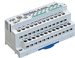
FN-X16TS41 16-point Discrete Input