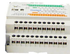
FN-XY16SK41 16-point Discrete Input 16-point Sink Transistor Output