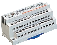
FN-Y16SK41 16-point Discrete Sink Output