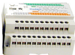
FN-XY16SC41 16-point Discrete Input 16-point Source Transistor Output