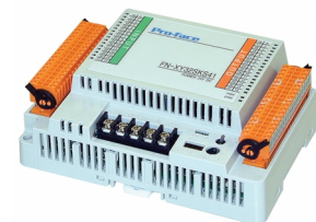
FN-XY32SKS41 32-point Discrete Input 32-point Sink Transistor Output