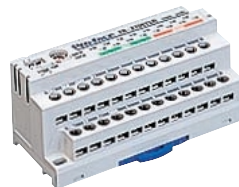
FN-XY08TS41 8-point Discrete Input 8-point Sink Transistor Output