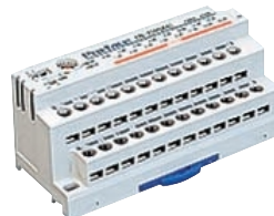
FN-Y16SC41 16-point Discrete Source Output