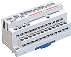
FN-Y08RL41 8-point Relay Discrete Output