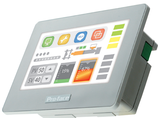
4.3 inch TFT Color LCD Compact HMI