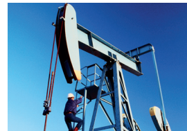
Oil & Gas